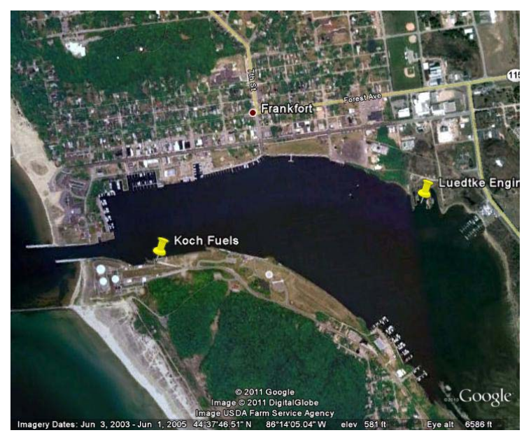
Figure E-2- Frankfort Harbor

Frankfort is a commercial port located on the east shore of Lake Michigan, 204 miles northeast of Chicago, IL and 28 miles north of Manistee, MI. Frankfort Harbor, 4.3 miles south of Point Betsie, is in Betsie Lake, which is connected to Lake Michigan by an entrance channel. (Figure E-2) In October 2005, the controlling depth of the channel was 22 feet in the entrance, through the outer basin and between the piers to the inner basin.