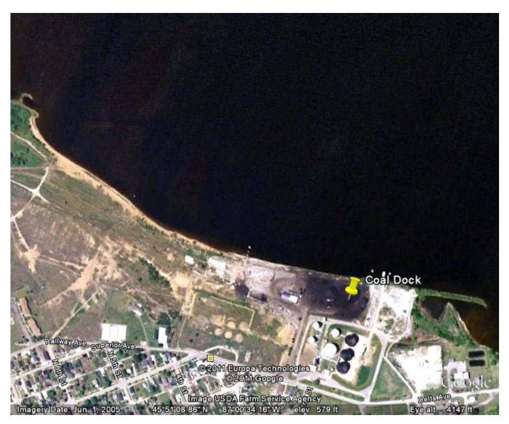
Figure E-8- Gladstone MI, Google Earth March 2011