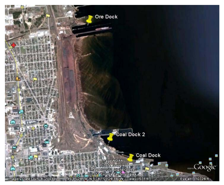
Figure E-7- Escanaba, MI, Google Earth

Little Bay de Noc is the west arm of the north end of Green Bay and forms the entrance waters to the ports of Escanaba and Gladstone Michigan. Escanaba, MI, is on the West side of Little Bay de Noc, 6 miles NE of Ford River and 7 miles NW of Peninsula Point. (Figure E-7) The harbor has depths of 28 to 40 feet within 0.4 mile of shore. Escanaba has several deep-draft facilities on the W side of the harbor N of Sand Point.