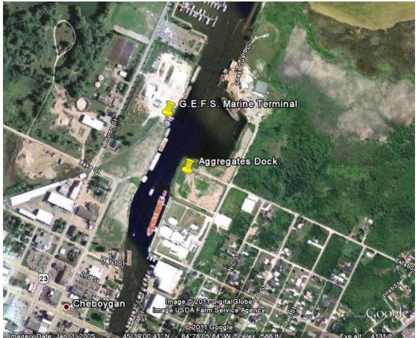
Figure E-5- Cheboygan, MI, Google Earth

Aggregates Dock: E side of the river above Amoco Oil Co. Wharf; deep-draft vessels lay in dredged channel and discharge by boom; 160,000 square feet open storage; receipt of aggregates; operated by various concerns.