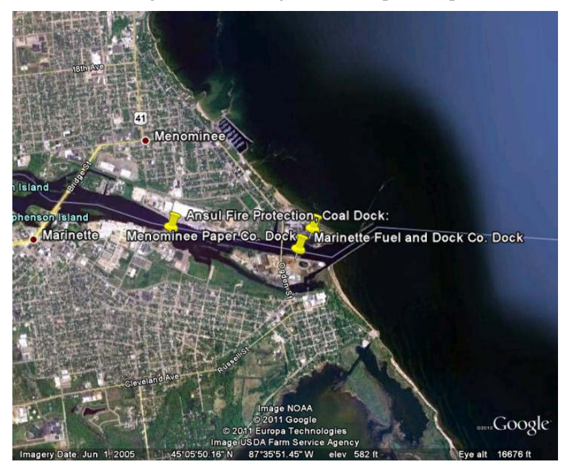
Figure E-6- Menominee, MI Google Earth

Menominee River and thence upstream for about 1.7 miles to about 600 feet below the Dunlap Avenue Bridge. In July 2009, the controlling depths were 19 feet in the entrance, between the piers, and in the river channel to just above the turning basin. Shoaling has been reported upriver from the turning basin.