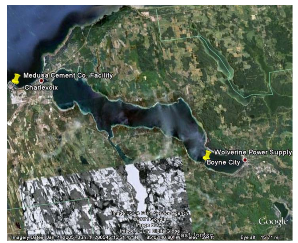
Figure E-1- Charlevoix, MI Harbor, Google Earth

The U.S. Army Corps of Engineers has project depths of 18 feet in Lake Michigan and; 17 feet in inner channels to Lake Charlevoix. However, recent shoaling and a lack of maintenance dredging may have reduced the allowable draft in portions of the channel. Lake Charlevoix extends about 14 miles SE from the head of Pine River and is from 1 to 2 miles wide, with depths to over 100 feet and deep water generally close to shore. Boyne City, MI, is at the SE end of the lake.